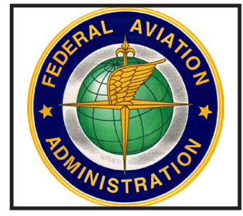
Figure 1: FARS Section 14, part 137 of the Code of Federal Regulations specifically addresses agricultural aircraft operations.

Dispensing any economic poison (e.g., pesticides).